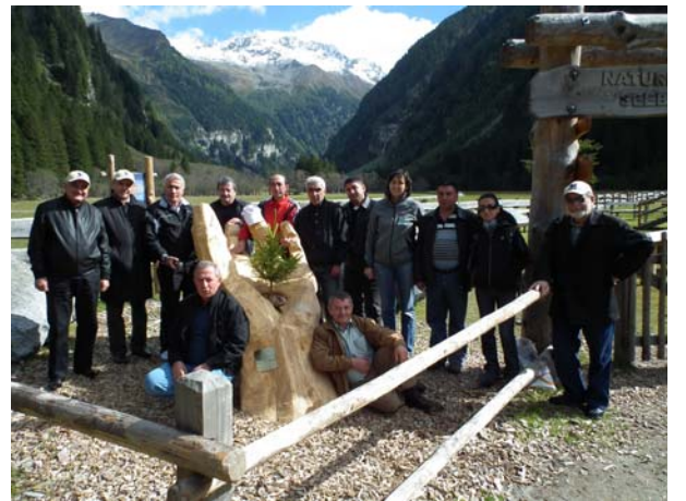
Group photo during the walk on Nature Experience Trail Seebachtal