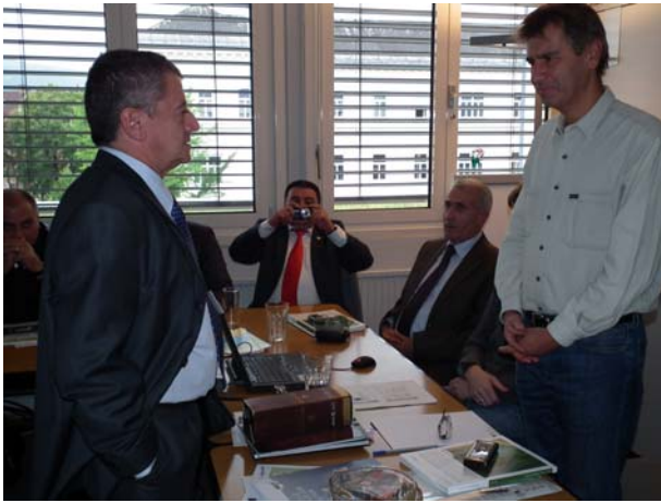
Presenting gifts after meeting in Carinthian Federal Government