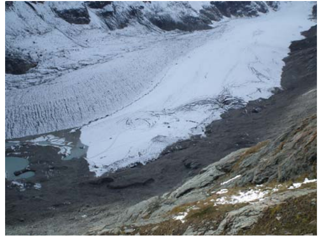
Glacier in Hohe Tauern National Park is drastically melting