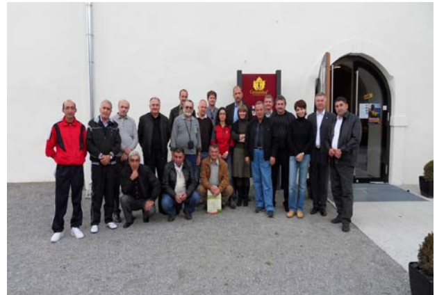
Group picture on the entrance of visitors center of Nature Park Südsteirisches Weinland