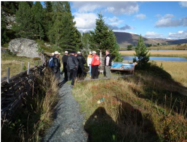
Walk over the path Nockalmstrasse in National Park Nockberge