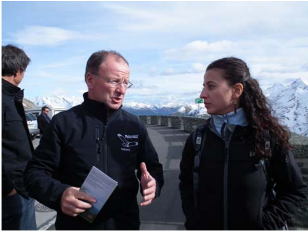
Interviewing Director of Hohe Tauern National Park