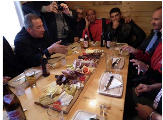
Dinner in farmer's house with local specialties