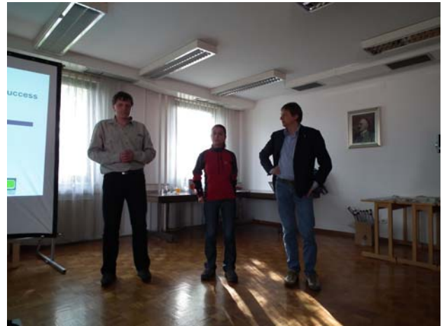
Directors of Triglav National Park (Slovenia) and Julian Prealps Nature Park (Italy) with translator