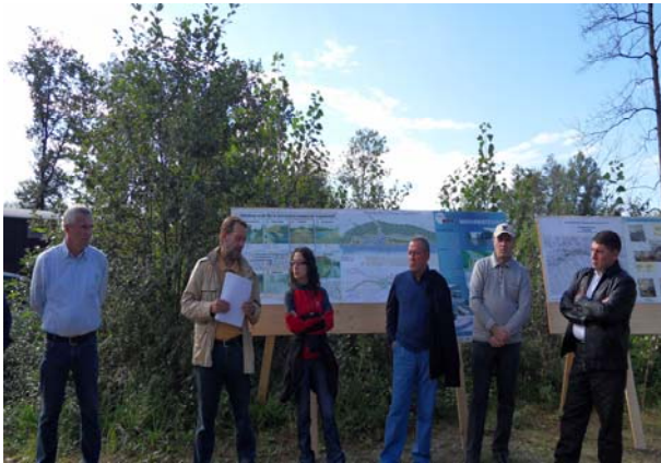
Introducing INTERREG project „Living space Lower Murtal“