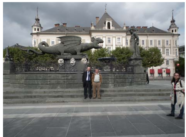
The Dragon, symbol of Klagenfurt