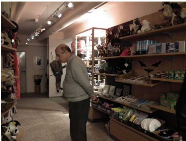
In the shop of Information Center (BIOM) of Triglav National Park