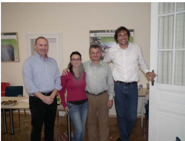
Directors of Environmental Consulting Klagenfurt with Translator and Project Manager